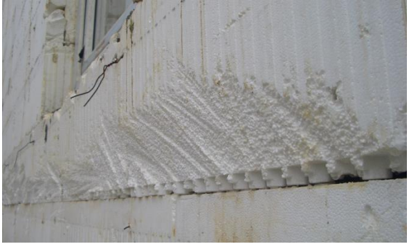
Fig. 4: Fragment of the outer wall with defect, "rectified" flush

some activities for its improvement. Fig. 4 shows a fragment of outer wall, prepared for finishing work.