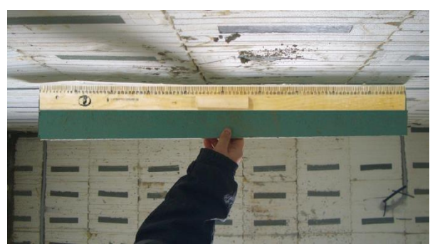
Fig. 1: Identified deviation of ceiling surface from the design position

Technological defects of cast-in-situ RC structures, built in the permanent EPS formwork, revealed during the visual inspection (Fig. 1).