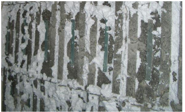
Fig. 3: Fragment of a wall with the removed layer of EPS formwork

Such defect is not critical, but is subject to mandatory resolve. The divergence of formwork panels due to the increase of thickness of RC wall and causes a decrease in thickness of thermalinsulation layer of EPS. Decrease of thermalinsulating layer is associated with the possibility of freezing of wall in winter. To resolve the defects, it is necessary to cut off a significant portion of EPS formwork with the need for designed vertical position of wall without anomalous irregularities. Fig. 3 shows a fragment of wall with the removed layer of EPS formwork.